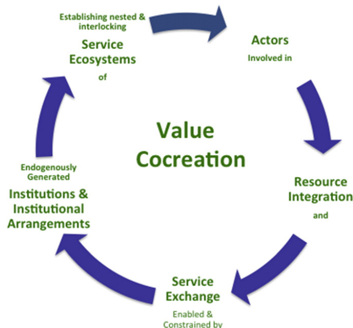
Fig. 1. The narrative and process of S-D logic. Note: Vargo and Lusch (2016) .

With the addition of institutions and service ecosystems to S-D logic’s foundational concepts, we believe S-D logic can begin to be something more than the lens, framework, and perspective, as we have characterized it up to now. That “something more” can take several forms, each with its own potential impact. At a minimum, it affords the completion of a relatively coherent narrative of value cocreation through resource integration and service exchange, coordinated by shared institutional arrangements that define nested and overlapping service ecosystems (see Fig. 1 ).